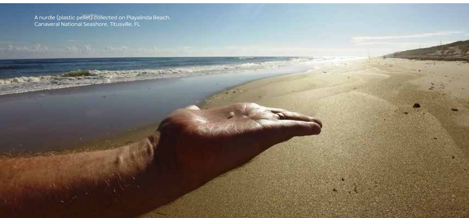
A nurdle (plastic pellet) collected on Playalinda Beach, Canaveral National Seashore, Titusville, FL